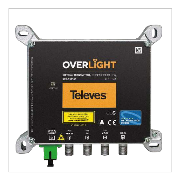
Televes reserves the right to modify the product